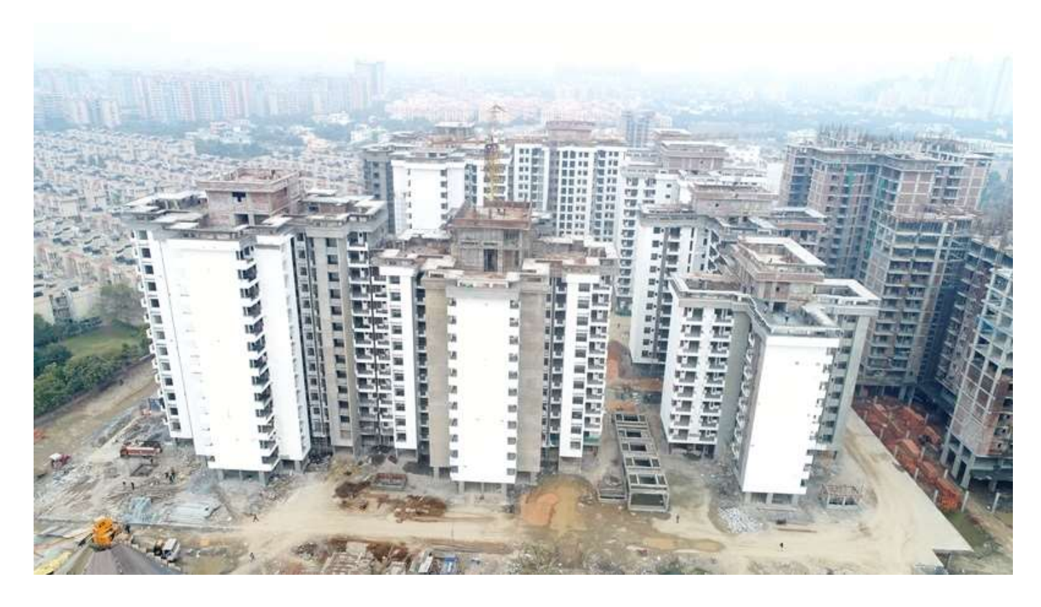
In Block B-03 6th floor Roof slab 75% casted.

In Block C-15 Machine Room above parapet wall slab casted.