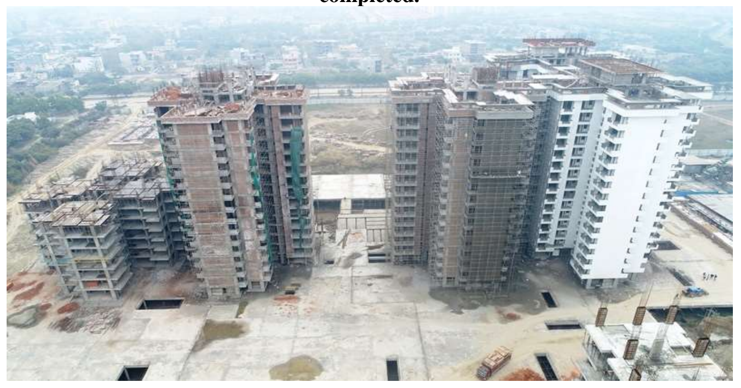
In block D-05 External Plaster work in progress.

In Block D-04 Machine Room Roof Slab Reinforcement binding work completed.